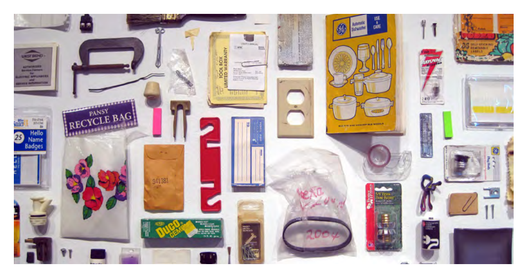
My parents' junk drawer and its contents hung on the wall (detail)