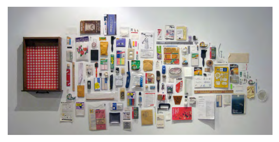
My parents' junk drawer as of today